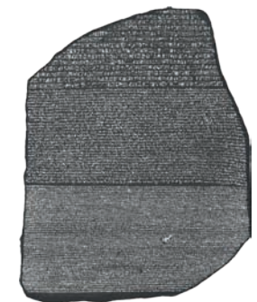
The Rosetta Stone (currently in the British Museum, London)