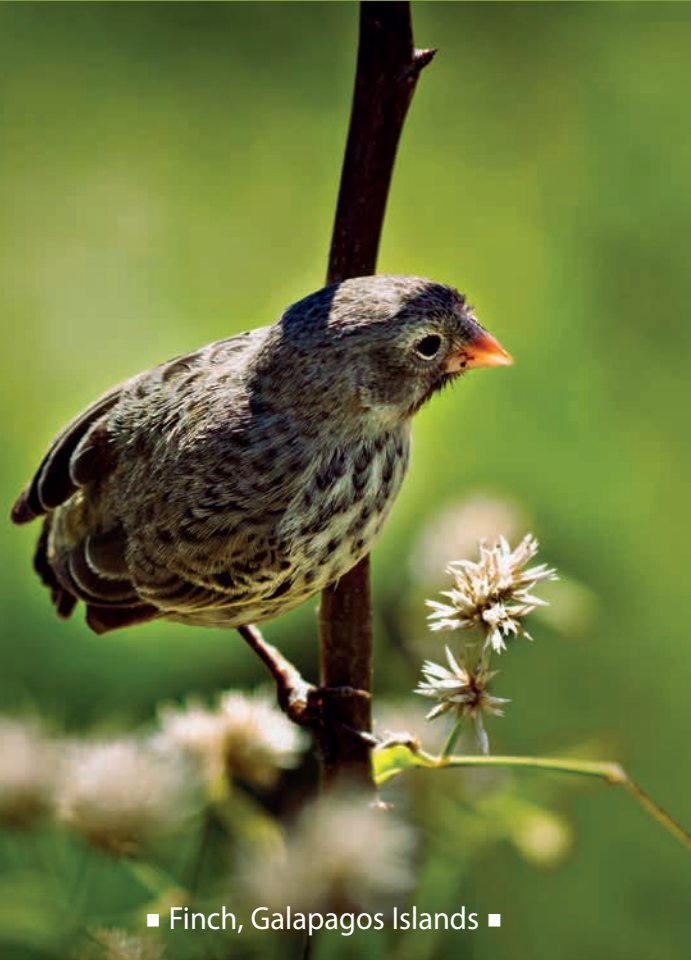
■ Finch, Galapagos Islands ■